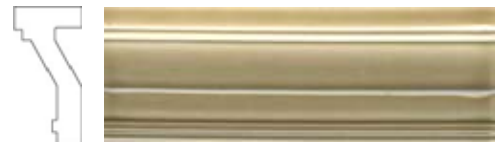
DAVIS 2" x 6" M218