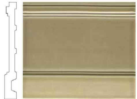
GREGORY BASE MOLDING 5" x 6" M219