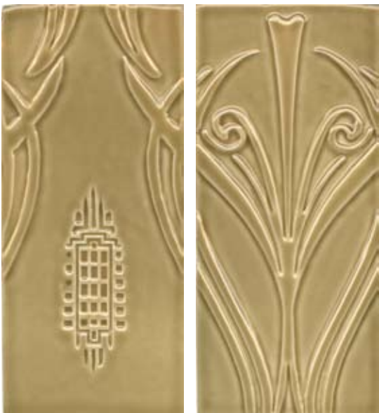
AVALON 4" x 9" V1 (Two Part Pattern)