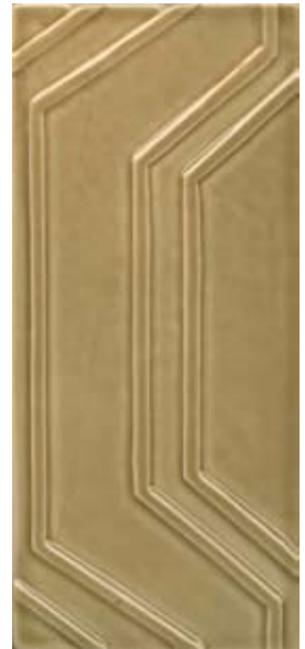
PALADIUM 4" x 9" V4