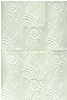
CONCEPT BOARD #46 HARLOW