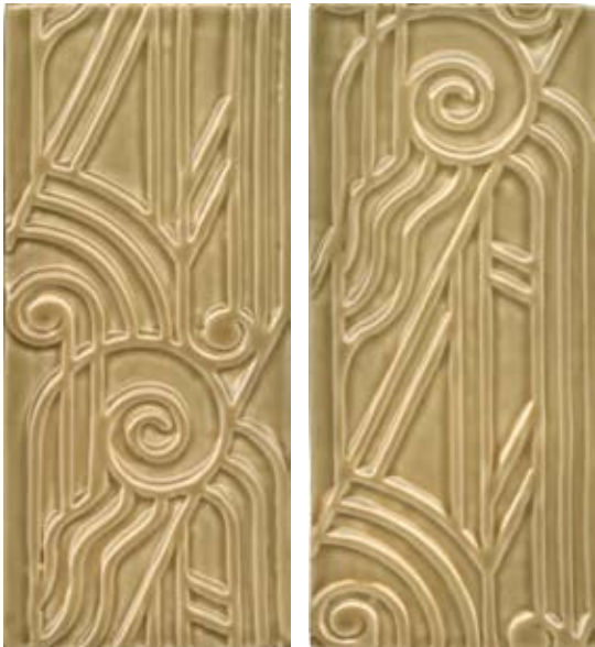
HARLOW 4" x 9" V3 (Two Part Pattern)