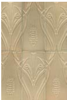
CONCEPT BOARD #52 AVALON