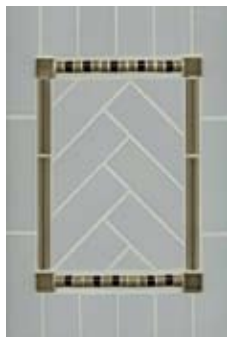
CONCEPT BOARD #53 BEADED FISH BONE