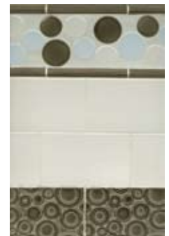
CONCEPT BOARD #56 POLKA DOT DOT DOT