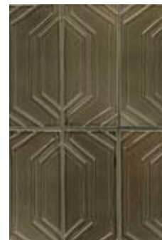
CONCEPT BOARD #55 PALADIUM