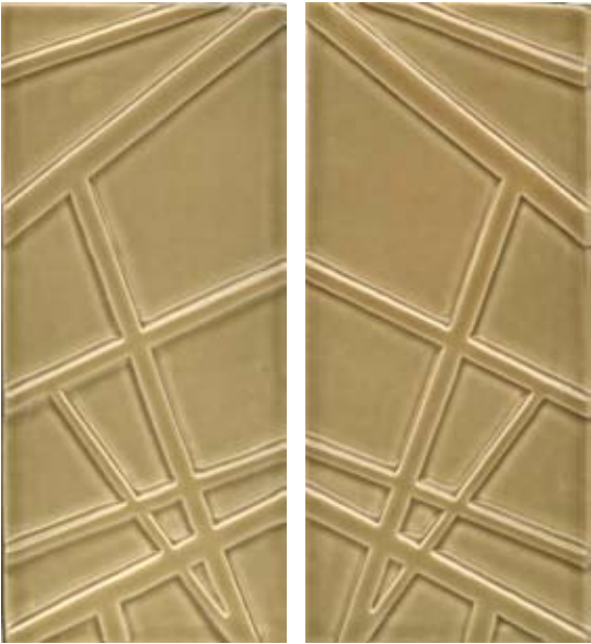
DELANO 4" x 9" V2 (Two Part Pattern)